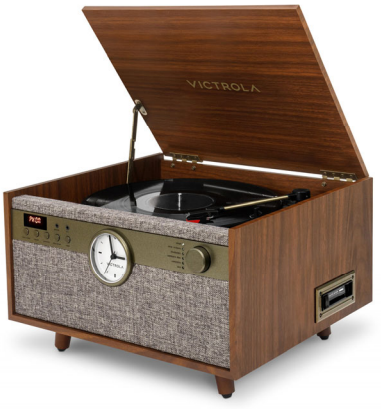
Left: VTA-835-BLK | Top: VTA-820SB-NAT Bottom: VTA-830SB-WLN